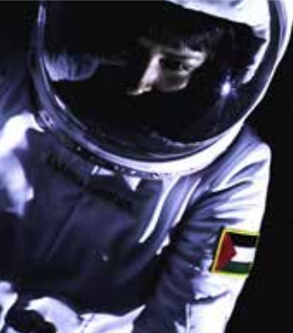
LARISSA SANSOUR A Space Exodus

Showgirls , 2014 Oil, flashe, and acrylic ink on canvas Courtesy of the artist and Elizabeth Dee, New York