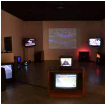
Tyrone Davies In Camera 2015

THE PROJECTS GALLERY is Utah Museum of Contemporary Art's initiative to promote local artists as they engage the contemporary art world locally and nationally. Situated at the front of UMOCA, the Projects Gallery is the first exhibition room that visitors encounter when entering the building. The Projects Gallery exhibits proposals entirely from Utah artists, providing them with a professional exhibition environment, prominent exposure to UMOCA visitors, and through UMOCA's increasing national ties, the possibility of greater exposure around the country.